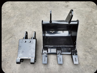
MS01 Quick hitch